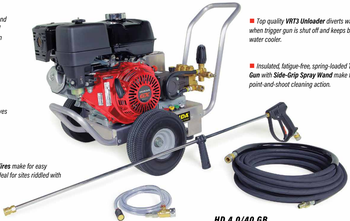
HD 4.0/40 GB

■ Puncture proof, Flat-Free Tires make for easy maneuvering on any terrain, ideal for sites riddled with nails and debris.