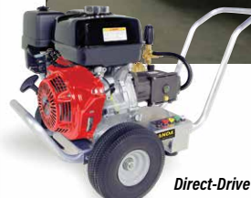
Direct-Drive HD Gas Cart