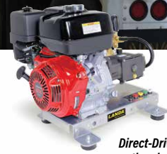
Direct-Drive HD Gas with optional skid mount feet