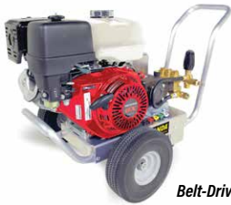
Belt-Drive HD Gas Cart