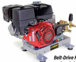
Belt-Drive HD Gas with optional skid mount feet