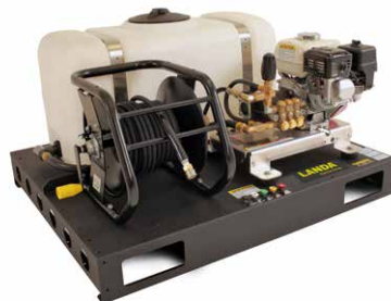
HD Direct Drive shown with optional HD Pallet Skid with Tank