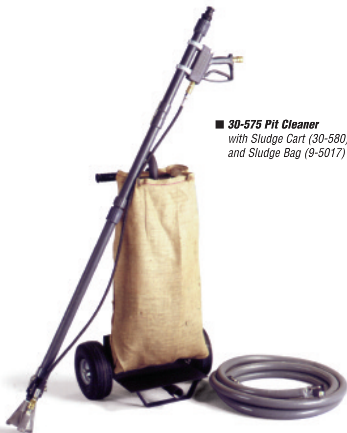
■ 30-575 Pit Cleaner with Sludge Cart (30-580) and Sludge Bag (9-5017)

PO Box 20037 • Portland, OR 97294 11811 NE Marx St • Portland, OR 97220 (800) 247-8103 • (503) 255-6508 www.landannorthwest.com