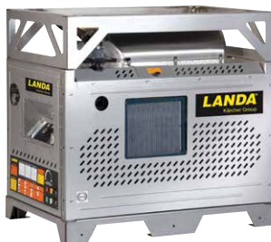
PDHW5-35624E/SS shown with optional stainless steel Lift/Stack Platform Kit and Emergency Air Shutoff Kit

This series fills the gap for those who are looking for the versatility of a compact pressure washer with the ruggedness and cleaning power of a full-size skid unit. It's packed with features and options that make it highly adaptable for use in a variety of different applications. You'll find a 2,900-watt generator that provides plenty of power for the burner, as well as a 120V outlet for low-wattage needs; forklift guides for easy transporting, mounting brackets to attach to a trailer, and an oversized, tilt-out fuel tank that'll assure you have hours of uninterrupted cleaning. A sturdy steel frame is available in a polyester powder coat finish for added weather protection, or all-stainless steel for the ultimate insurance in high corrosion environments, making this unit the ideal choice for an offshore oil drilling operation. Highly versatile and built with the same attention to quality you've come to expect from Landa Kärcher Group, the PDHW is a great all-around "mid-size" choice for all your cleaning needs!